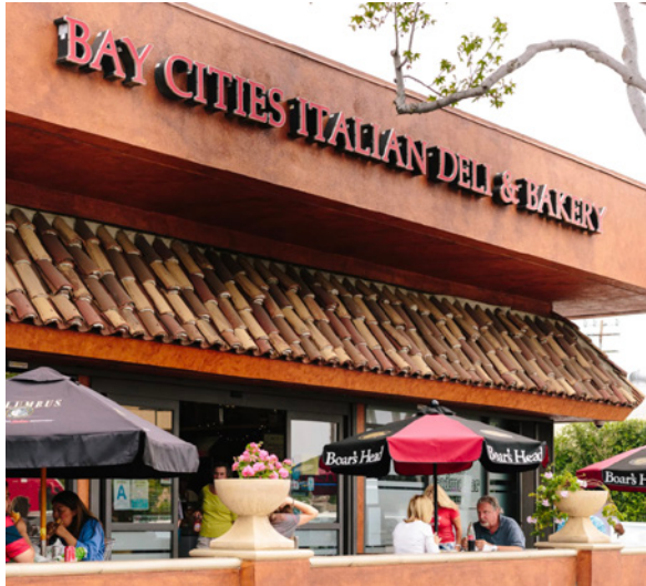
📍 BAY CITIES DELI / 1517 LINCOLN BLVD

WALKING DISTANCE TO SOME OF THE BEST AMENITIES ON THE WEST SIDE