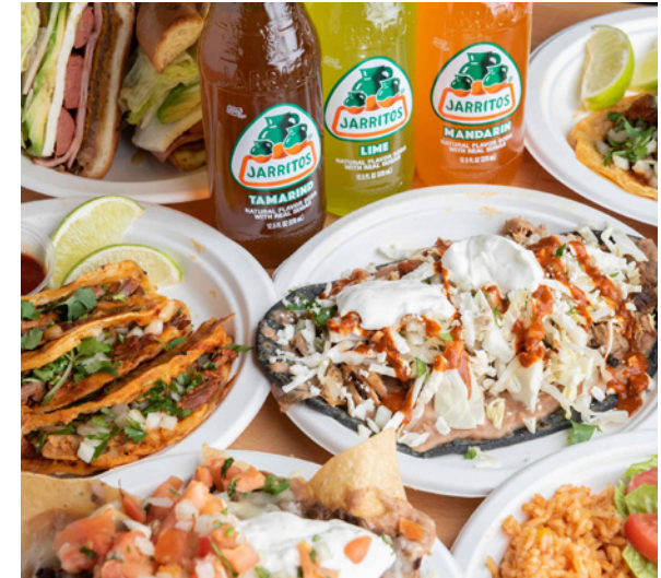
📍 TACOS POR FAVOR / 1408 OLYMPIC BLVD