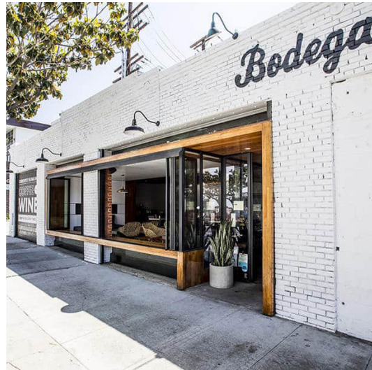
📍 BODEGA WINE BAR / 814 BROADWAY