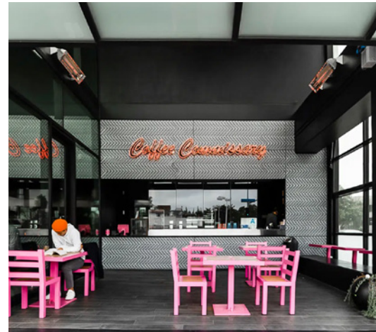
📍 COFFEE COMMISSARY / 1402 SANTA MONICA