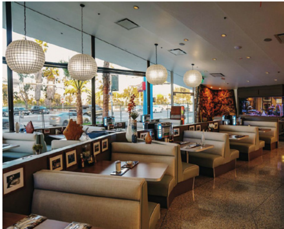
📍 MELS DRIVE IN / 1670 LINCOLN BLVD