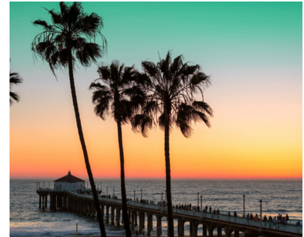
📍 SANTA MONICA BEACH