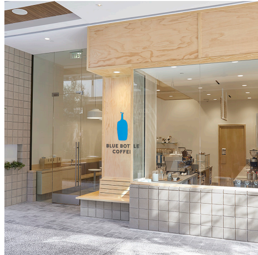
📍 BLUE BOTTLE - WESTFIELD CENTURY CITY