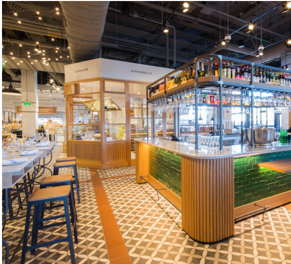
📍 EATALY - WESTFIELD CENTURY CITY