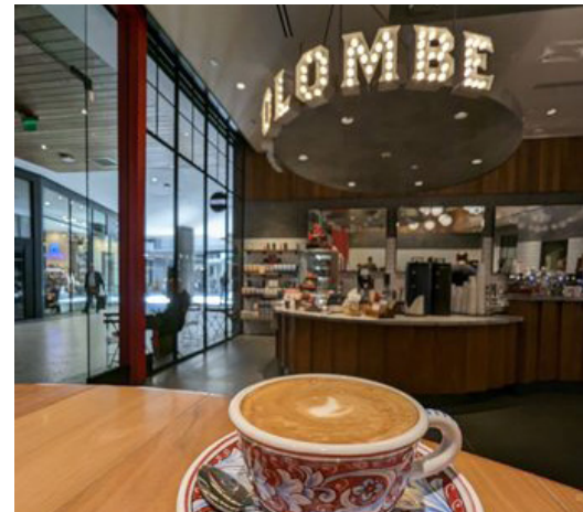
📍 LA COLOMBE - WESTFIELD CENTURY CITY