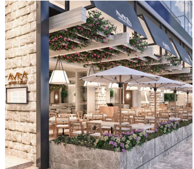
AVRA - N. BEVERLY DRIVE