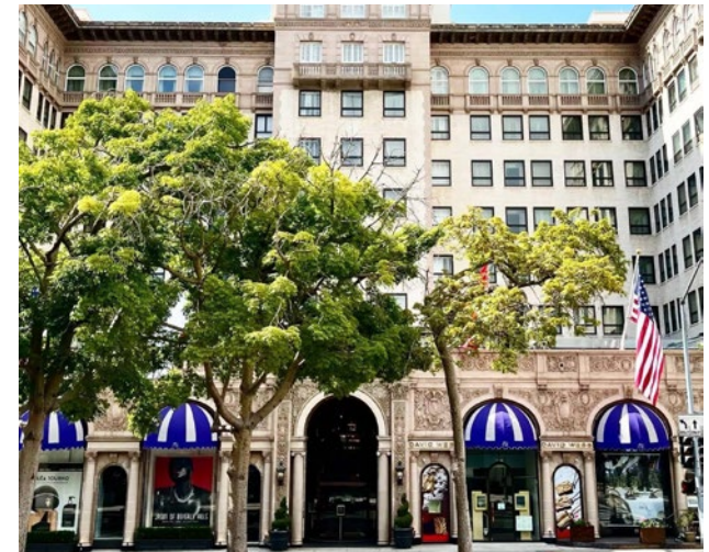
BEVERLY WILSHIRE HOTEL