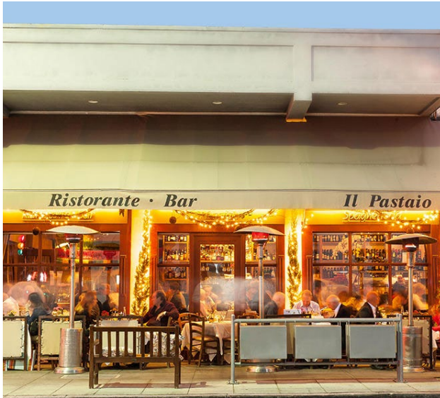
IL PASTAIO - CANON DRIVE

270 N. CANON DRIVE, SUITE 200, BEVERLY HILLS, CA 90210