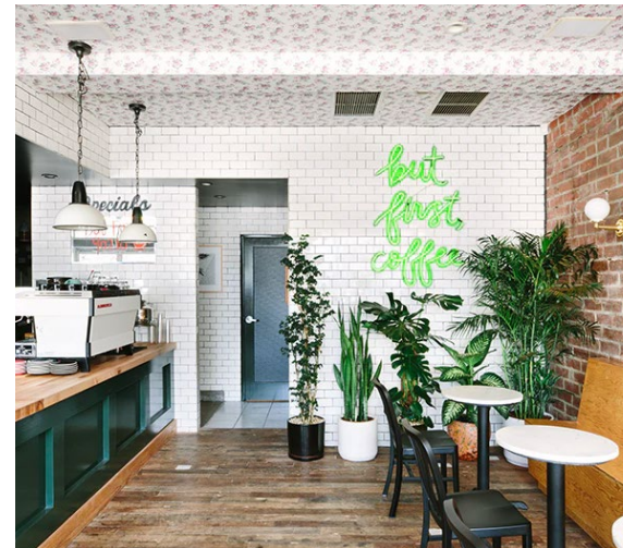
ALFRED COFFEE - SANTA MONICA BLVD