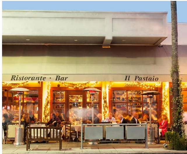
📍 IL PASTAIO - CANON DRIVE

436 N. ROXBURY DRIVE, BEVERLY HILLS, CA 90212