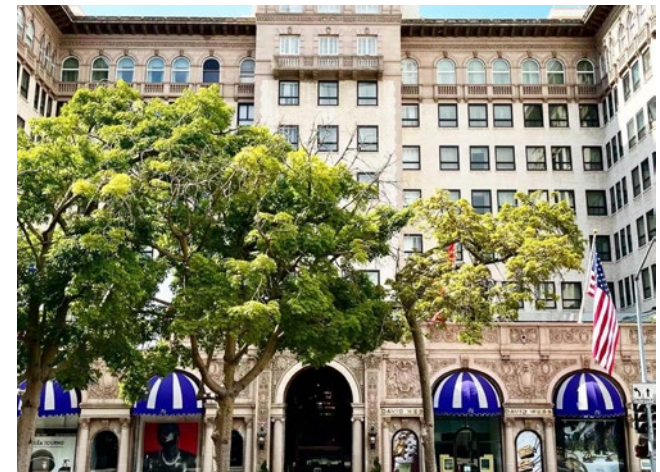
📍 BEVERLY WILSHIRE HOTEL