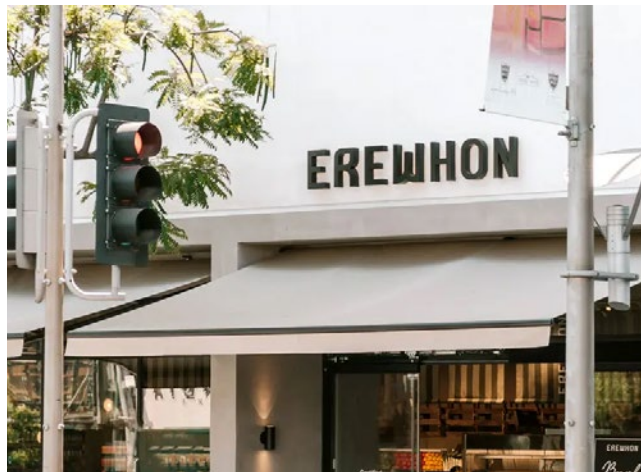
📍 EREWHON MARKET - N. BEVERLY DRIVE