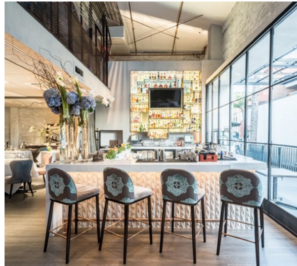
📍 CRUSTACEAN - N. BEDFORD DRIVE