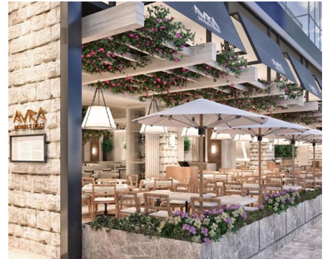
📍 AVRA - N. BEVERLY DRIVE