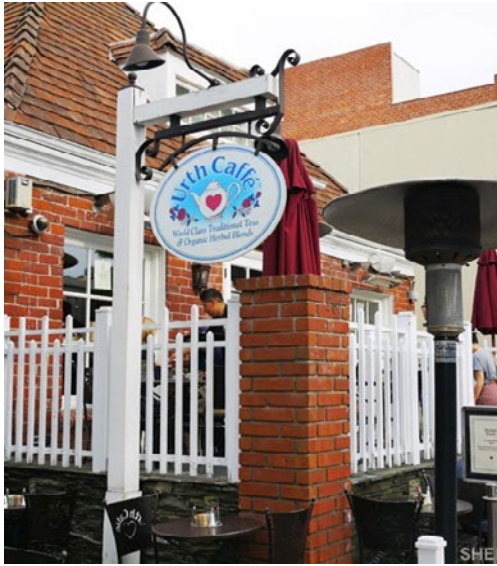
📍 URTH CAFFÈ