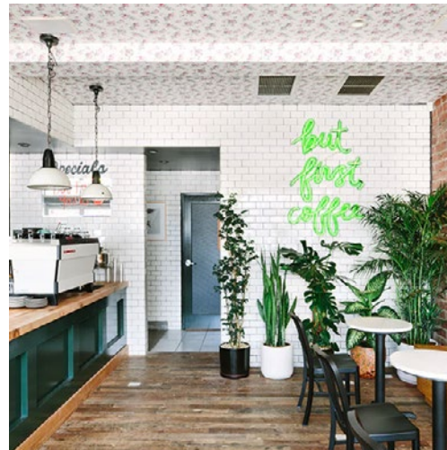
📍 ALFRED COFFEE