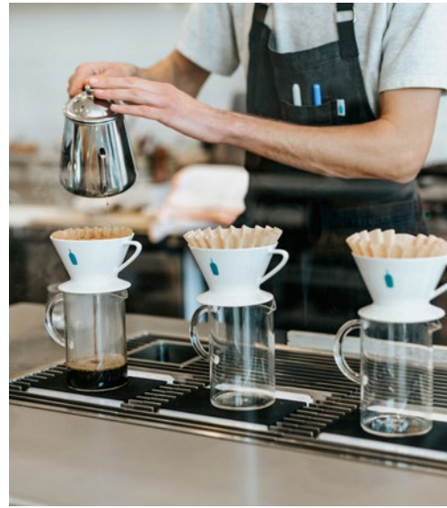
📍 BLUE BOTTLE COFFEE