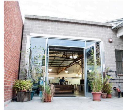
Bar Nine / 3515 Helms Ave 2 min drive