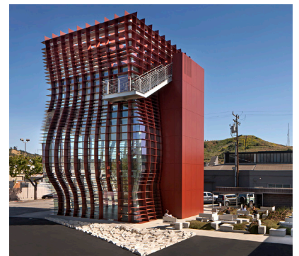
Vespertine / 3599 Hayden Ave 5 minute drive