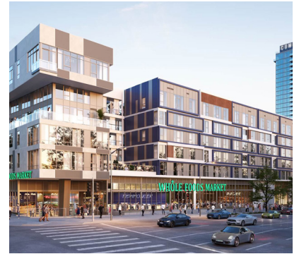
Whole Foods / 3377 S La Cienega Blvd 3 minute drive