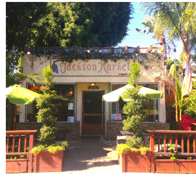
Jackson's Cafe / 5880 Jefferson Blvd 2 minute walk