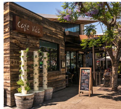
Cafe Vida / 9755 Culver Blvd 5 minute drive