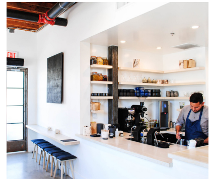
Destroyer / 3578 Hayden Ave 2 min drive