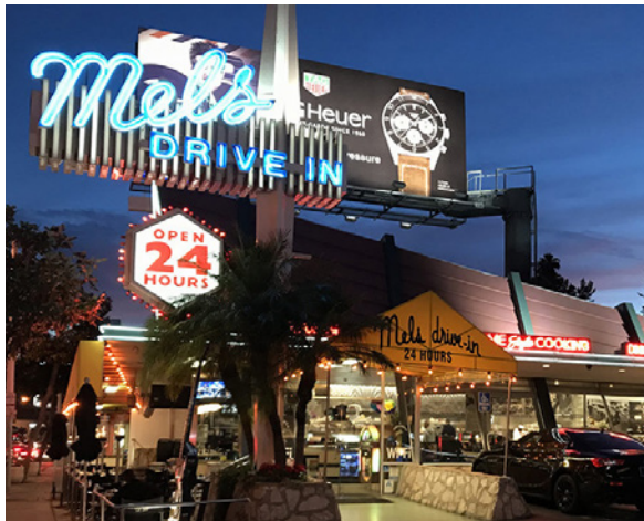
📍 MEL'S DRIVE-IN / 8585 W SUNSET BLVD