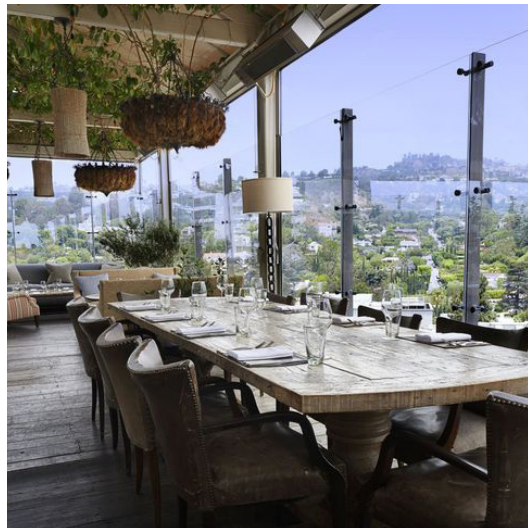
📍 SOHO HOUSE / 9200 SUNSET BLVD