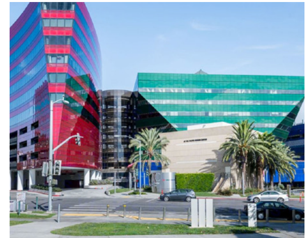
📍 PACIFIC DESIGN CENTER / 8687 MELROSE