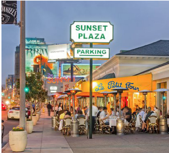
📍 SUNSET PLAZA / W SUNSET BLVD

WALKABLE TO SOME OF THE BEST AMENITIES IN WEST HOLLYWOOD