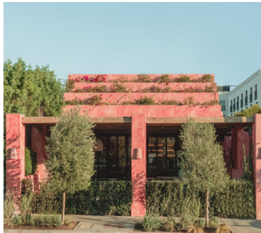
📍 GREAT WHITE / 8917 MELROSE AVE