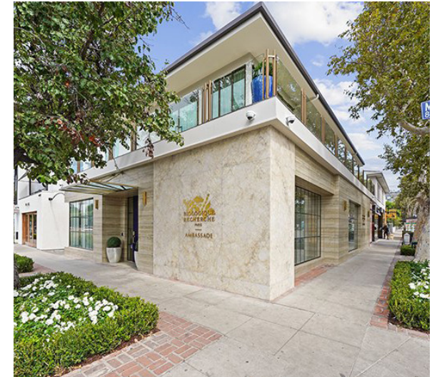
📍 MELROSE PLACE SHOPPING / MELROSE PL