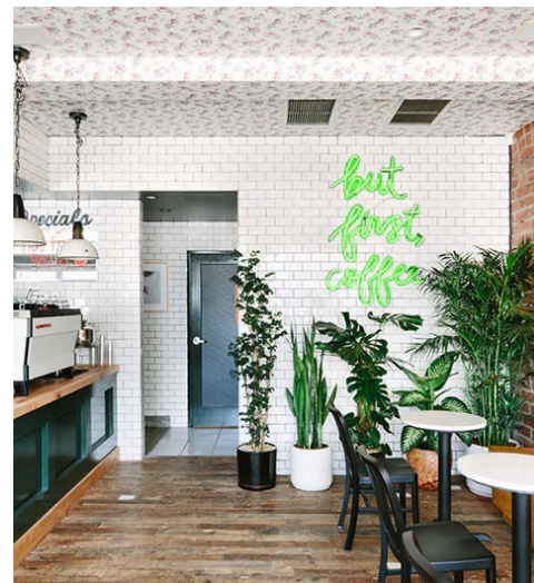
📍 ALFRED COFFEE